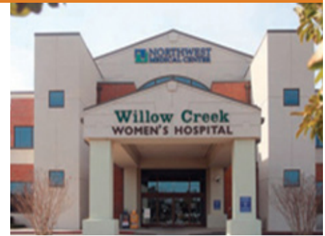
Northwest Hospital System - Willow Creek Women's Hospital | Johnson, AR

To read the full hospital spotlights for these hospitals and other EMPower hospitals, visit our website: www.EMPowerBreastfeeding.org and click on the EMPower hospitals tab.