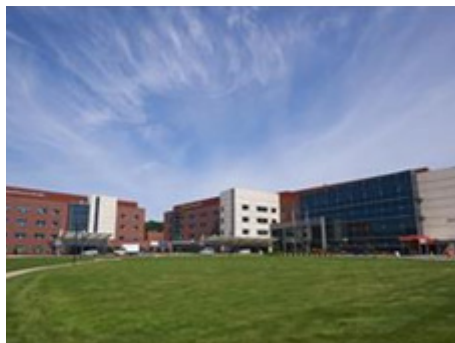
Williamsport Regional Medical Center | Williamsport, PA

Located in the northwestern region of Texas, Lubbock is a center of bustling economic, culture, education, and healthcare opportunities. University Medical Center is a national leader in patient satisfaction, and to optimize the level of care provided to mothers and babies, UMC embarked on the Baby-Friendly 4-D Pathway, with support from the EMPower initiative during the final phases. UMC is now a designated facility and is serving as a mentor to other hospitals in the initiative!