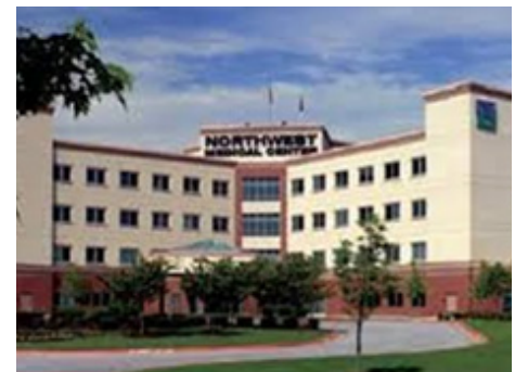
Northwest Medical Center - Bentonville | Bentonville, AR

Willow Creek Women's Hospital is committed to improving patient care for a diverse community through collaborations with local breastfeeding coalitions and community providers. Since joining the initiative and implementing the Ten Steps to Success Breastfeeding, they have seen a significant rise in exclusive breastfeeding rates and overall patient satisfaction. Willow Creek's dedication to mothers and infants has paid off - they recently became the first Baby-Friendly designated facility in Arkansas!