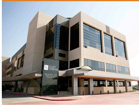
University Medical Center - Lubbock | Lubbock, TX

Located in the northwestern region of Texas, Lubbock is a center of bustling economic, culture, education, and healthcare opportunities. University Medical Center is a national leader in patient satisfaction, and to optimize the level of care provided to mothers and babies, UMC embarked on the Baby-Friendly 4-D Pathway, with support from the EMPower initiative during the final phases. UMC is now a designated facility and is serving as a mentor to other hospitals in the initiative!